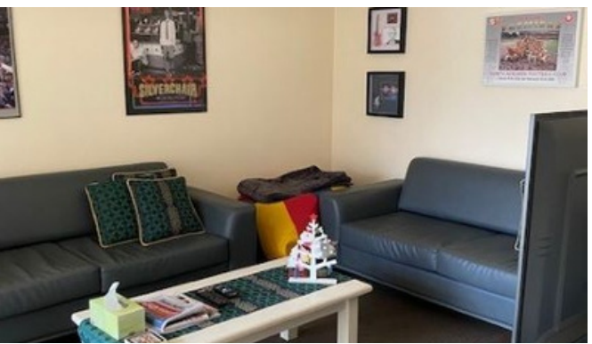
LDS has a vacancy at our delightful community in Hillcrest. This three-bedroom home with sleepover room is a neat, tidy and clean house with a male room mate in their 30s.

With lots of natural light, a garden and BBQ area, this home is situated in a hub with three other LDS managed houses. Because this is a community you will get access to community BBQs, activities and sports - cricket and basketball.