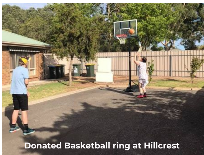
Donated Basketball ring at Hillcrest