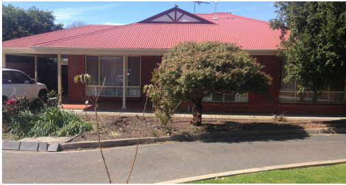
Hillcrest - Snell Street

House mate required to shared with a male in their 40s. This quiet house is situated in a cluster of 4 other LDS houses and enjoys community and friendships. 1:2 and passive overnights.