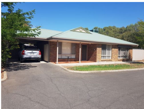
Hillcrest - Snell Street

House mate required to shared with a male in their 40s. This quiet house is situated in a cluster of 4 other LDS houses and enjoys community and friendships. 1:2 and passive overnights.